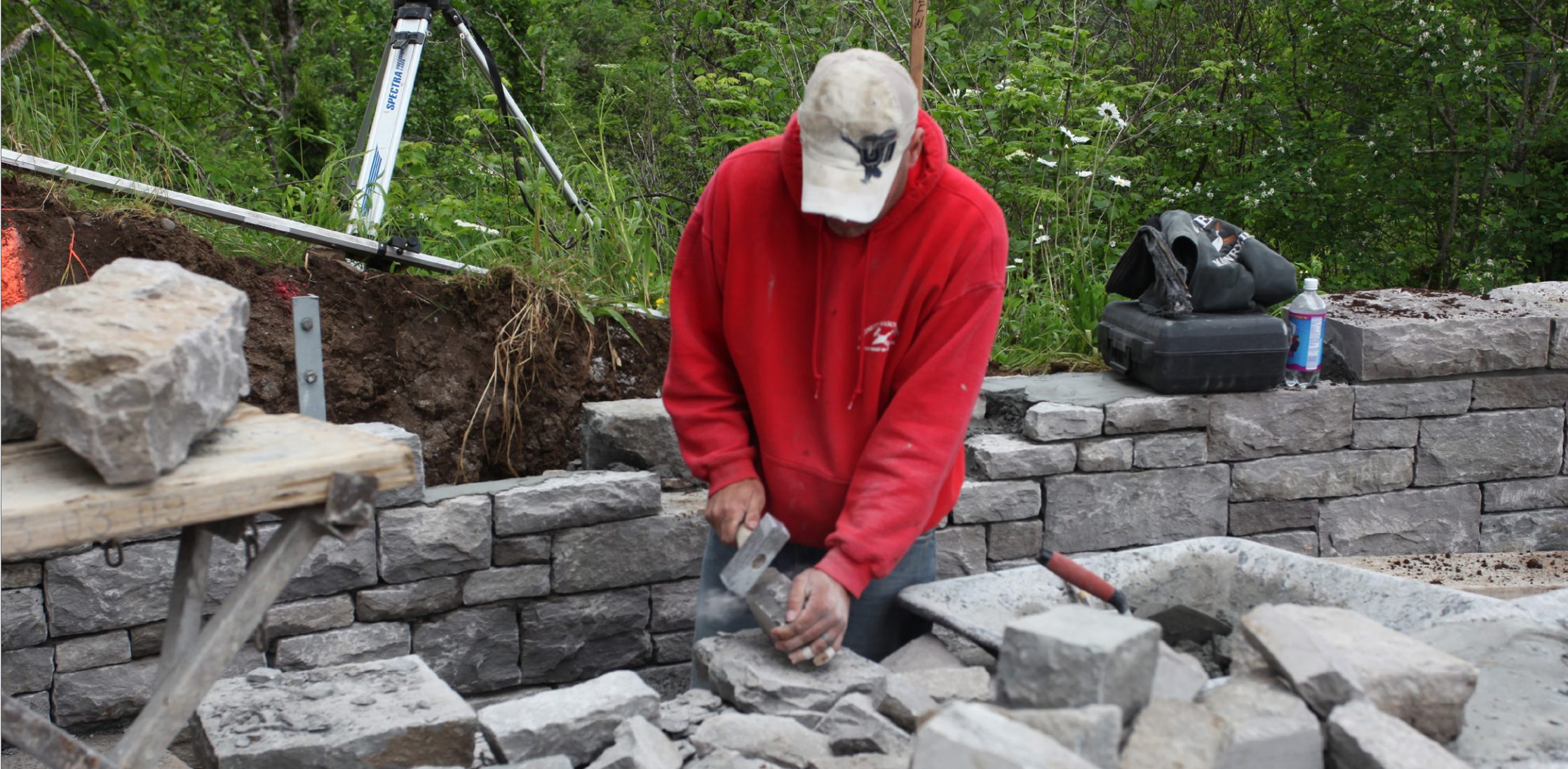
BUILT BY LOCAL STONEMASONS