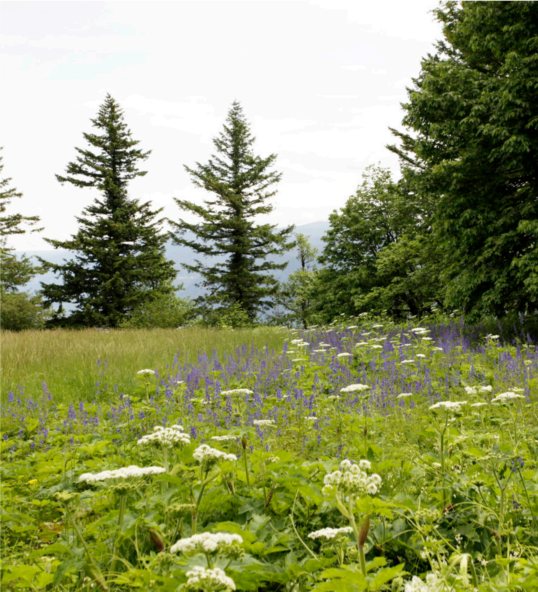
RESTORED NATIVE LANDSCAPE