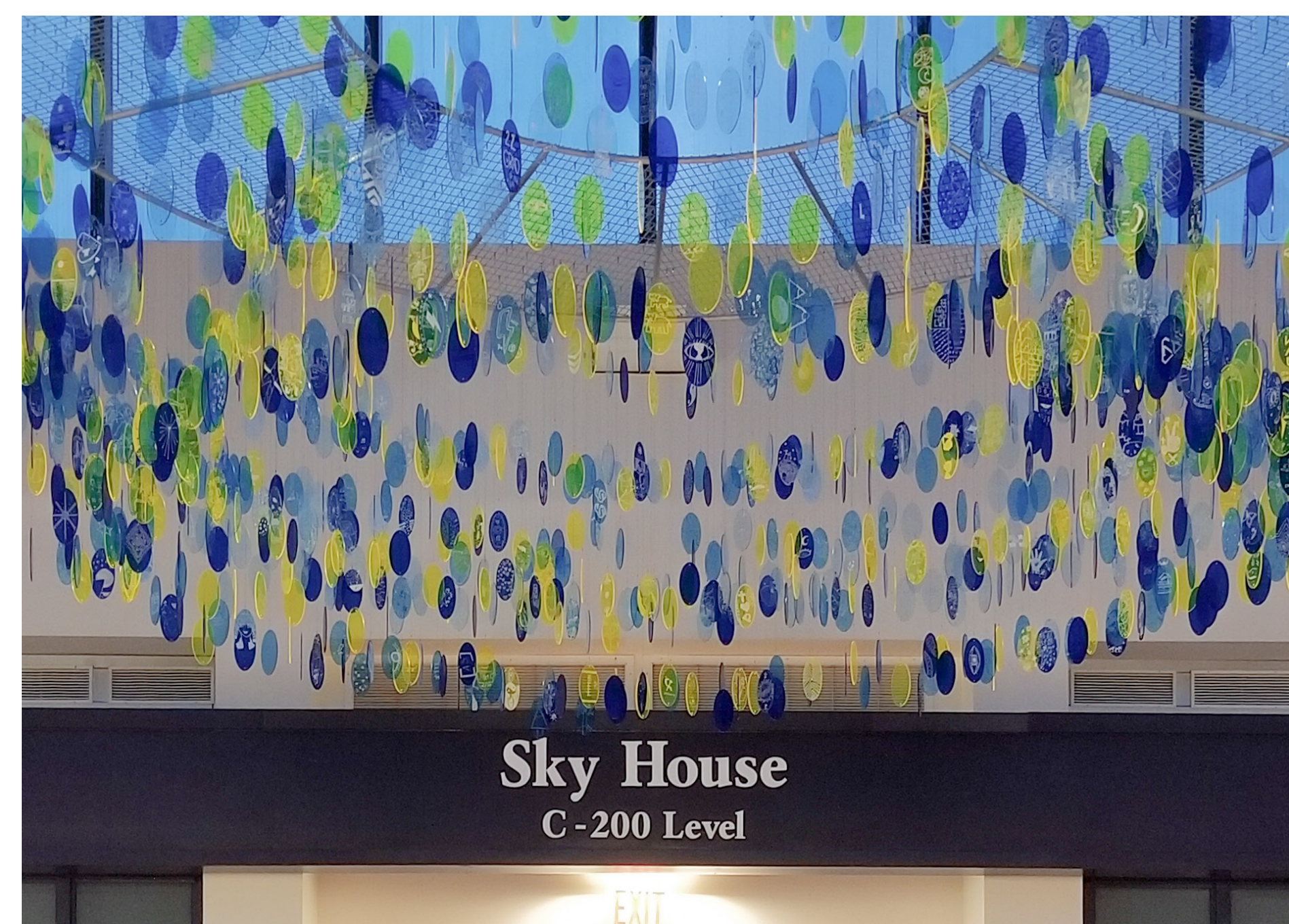
Sky House C-200 Level