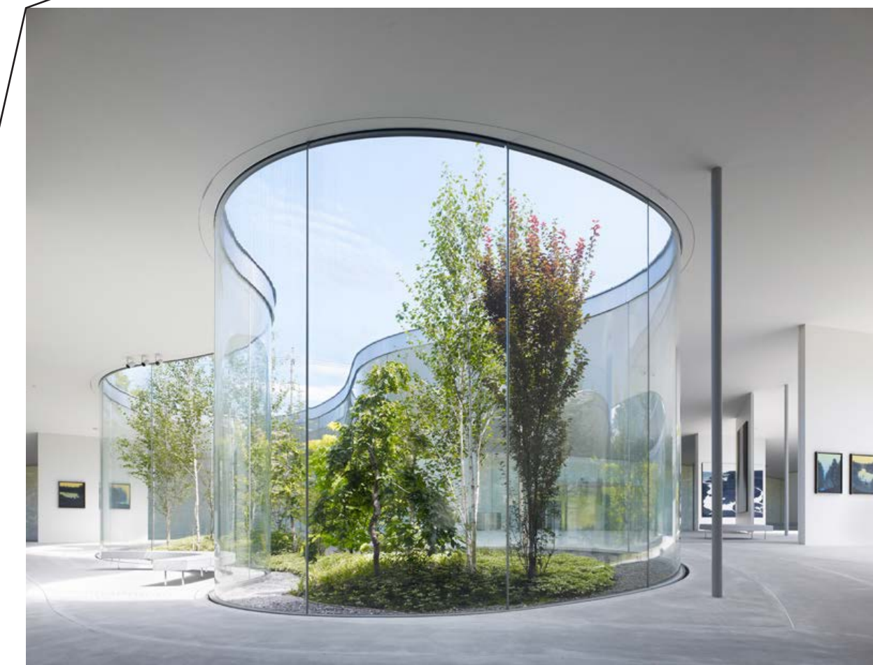
Hiroshi Senju Museum - Karuizawa, Japan Ryue Nishizawa