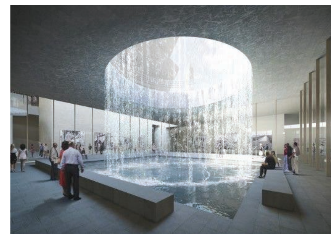
Smithsonian National Museum of African American History and Culture Washington, DC David Adjaye