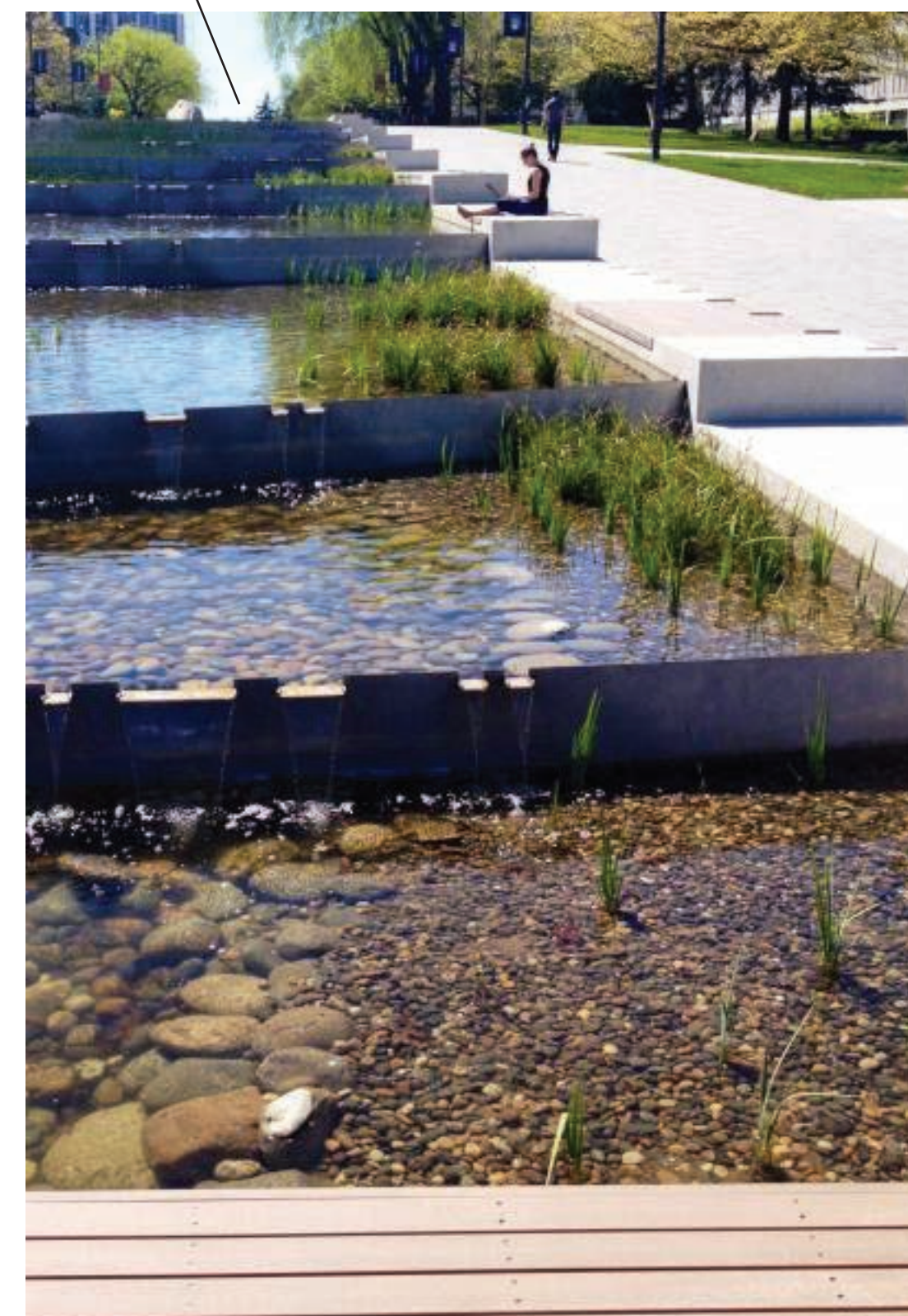
Cascading Stormwater Feature University of British Columbia, Vancouver