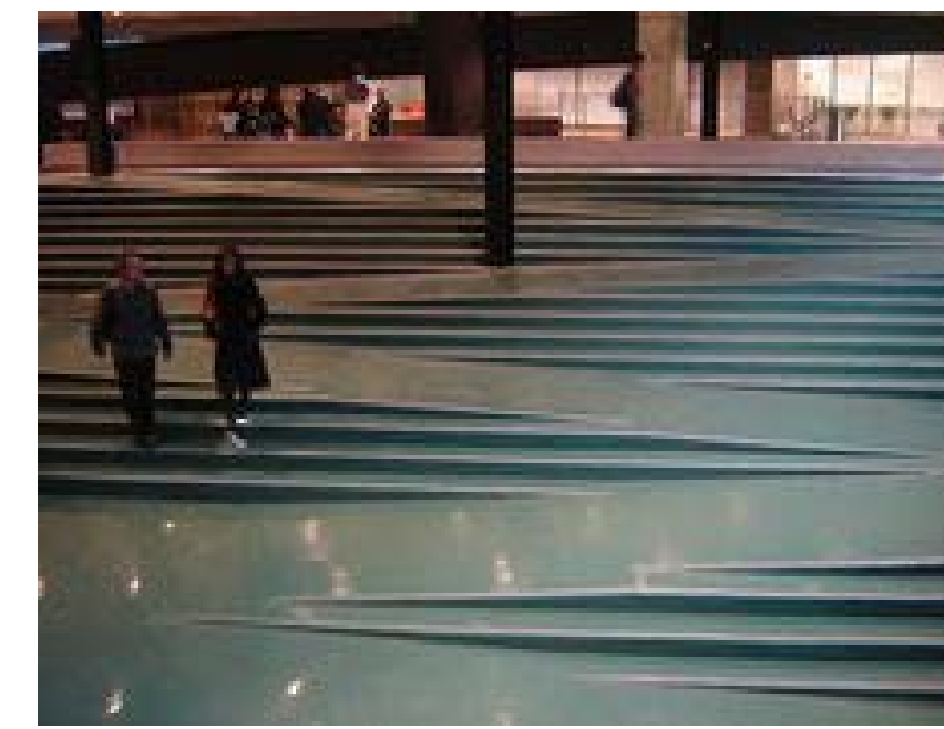
Illinois Institute of Technology Koolhaus Chicago, Illinois