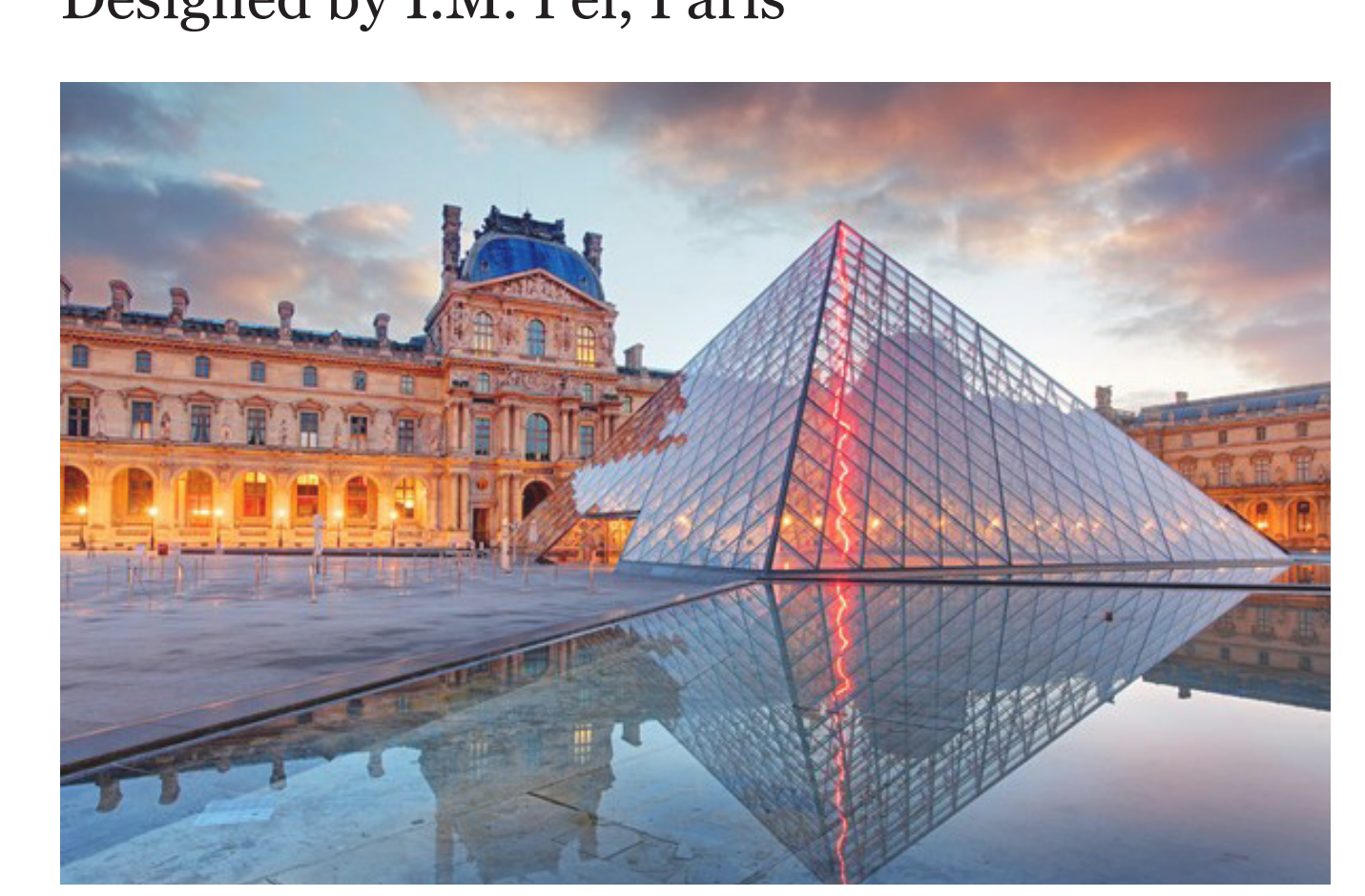
inspired by the modern glass structures that illuminate the site and reflect in the pools

Louvre Pyramid Designed by I.M. Pei, Paris