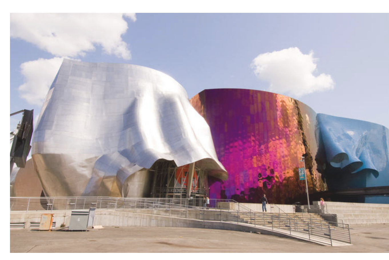
the interesting forms that emulate sound and music, inspired our forms for our glass pavilions