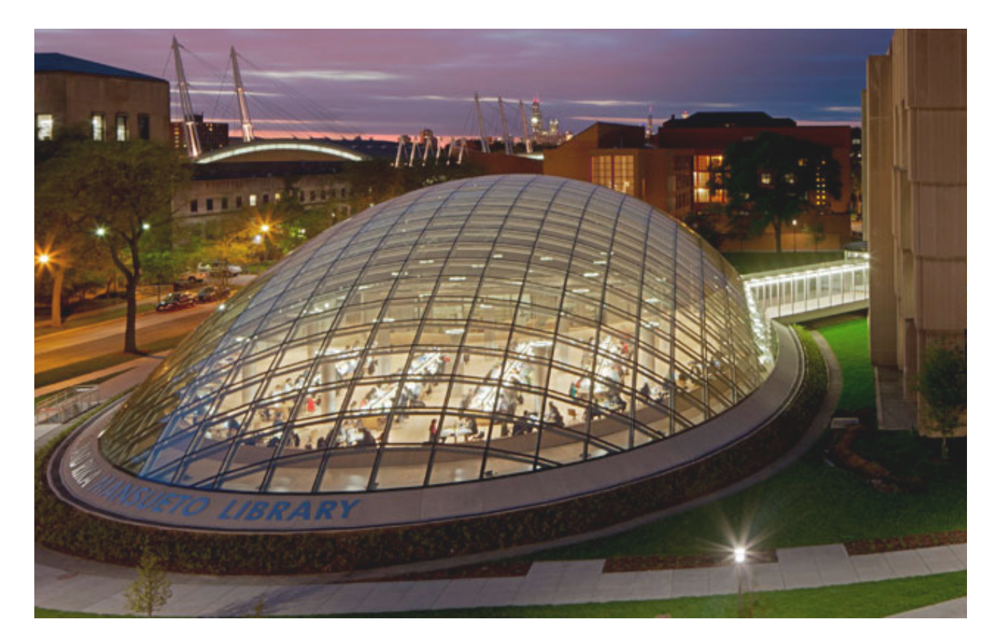
fascinated by the glowing orb created by this architect, this building acts as a warm retreat from the harsh Chicago winter