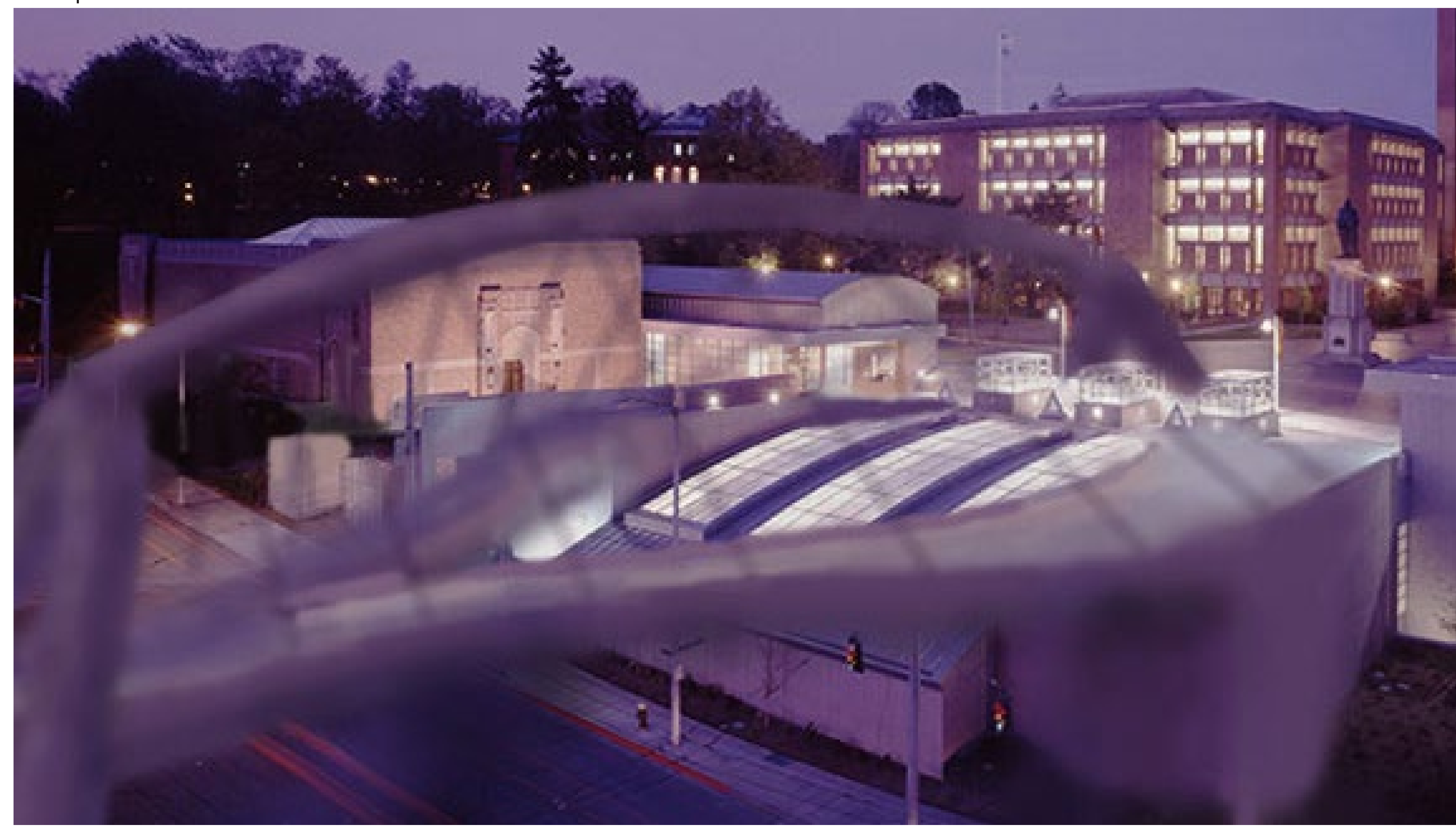
To design a better campus, every movement of the space needs to be reconsidered, especially the west threshold of the Central Plaza (aka. Red Square). That exit plays an important role in connecting the West Campus and the residence halls. After school, most of the people either take the route from W Stevens Way NE or the route getting out from the west threshold of Central Plaza then crossing the bridge over 15th Ave NE. None of these routes fit the ADA accessibility. Some people have to go further north and cross the traffic light next to the entrance of the Central Plaza Garage. Out team proposes having an ADA ramp along the south edge of Odegaard Undergraduate Library. The ramp then stops next to the Visitors Center. The movements of people do not stop right there. They walk across the George Washington Lane NE and get on the bridge that is inspired by the hourglass shape of Rainier Vista.