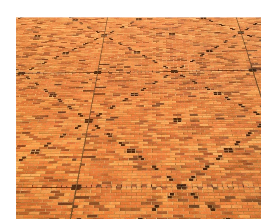
The bricks patterning on Meany Hall inspired our new ground patterning.