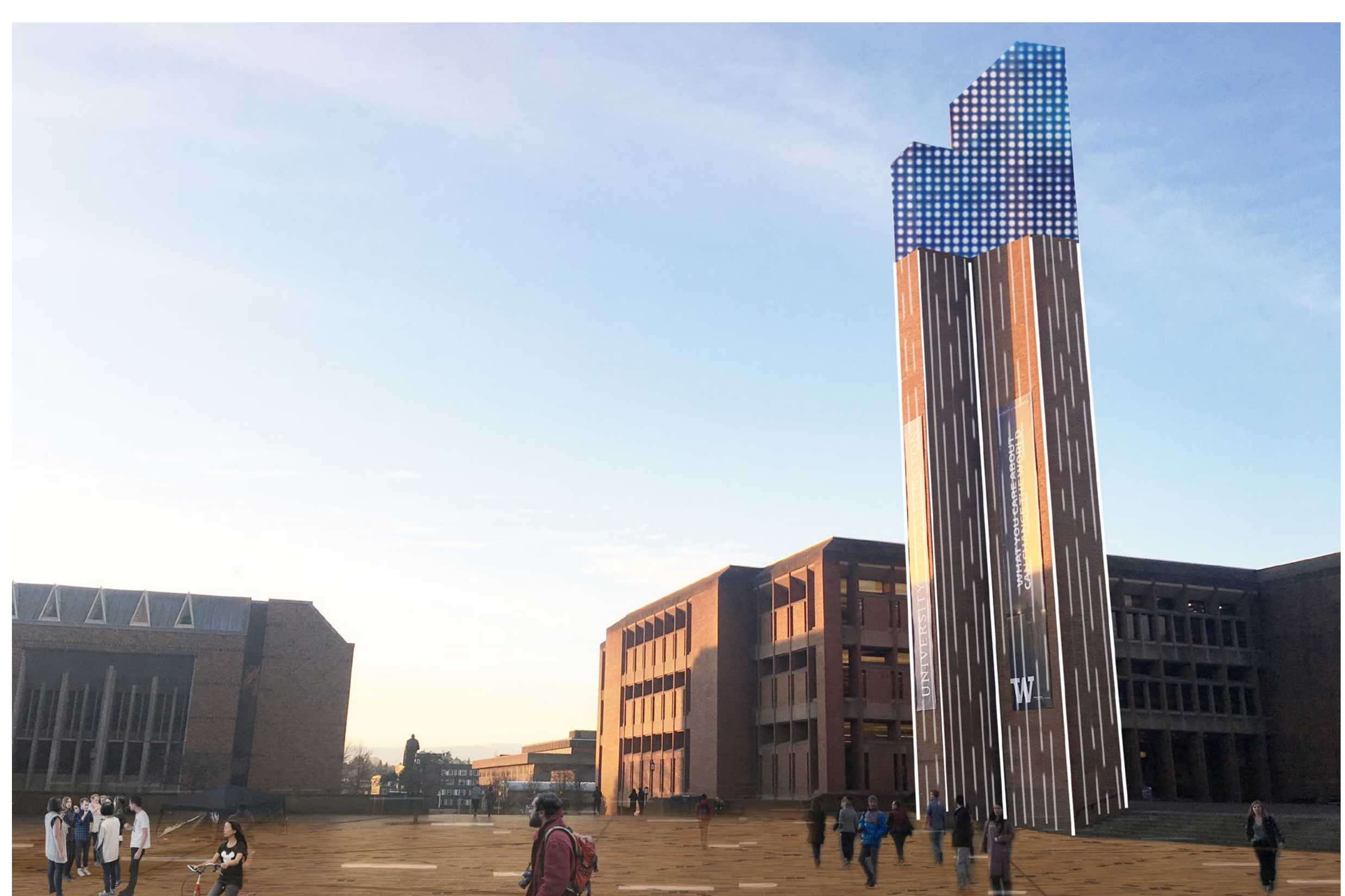
Artwork is projected on to the top of the vents towers to provide interest and wayfinding throughout the day.