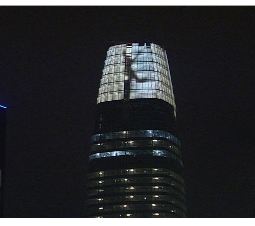
The artinstallation "DayForNight" provided inspiration about using the vent towers as a canvas for light projections.