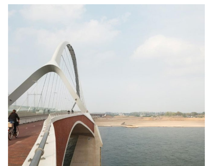
The City Bridge De Oversteek provided inspiration for the form of our bridge which also utilizes brick.