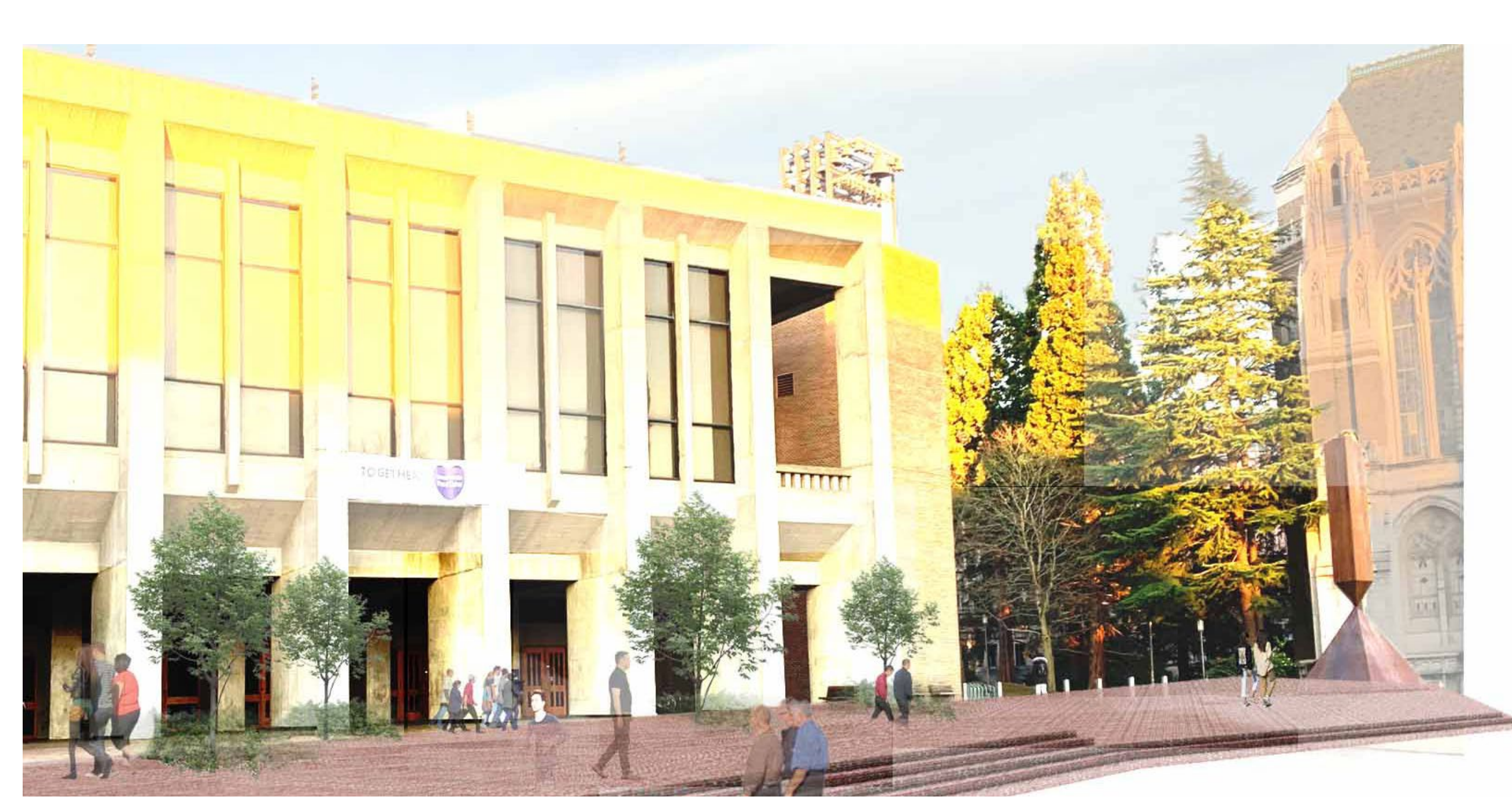
Plantations with shallow roots plants soften the edge of Kane Hall and Red Square while protecting the building structure below.