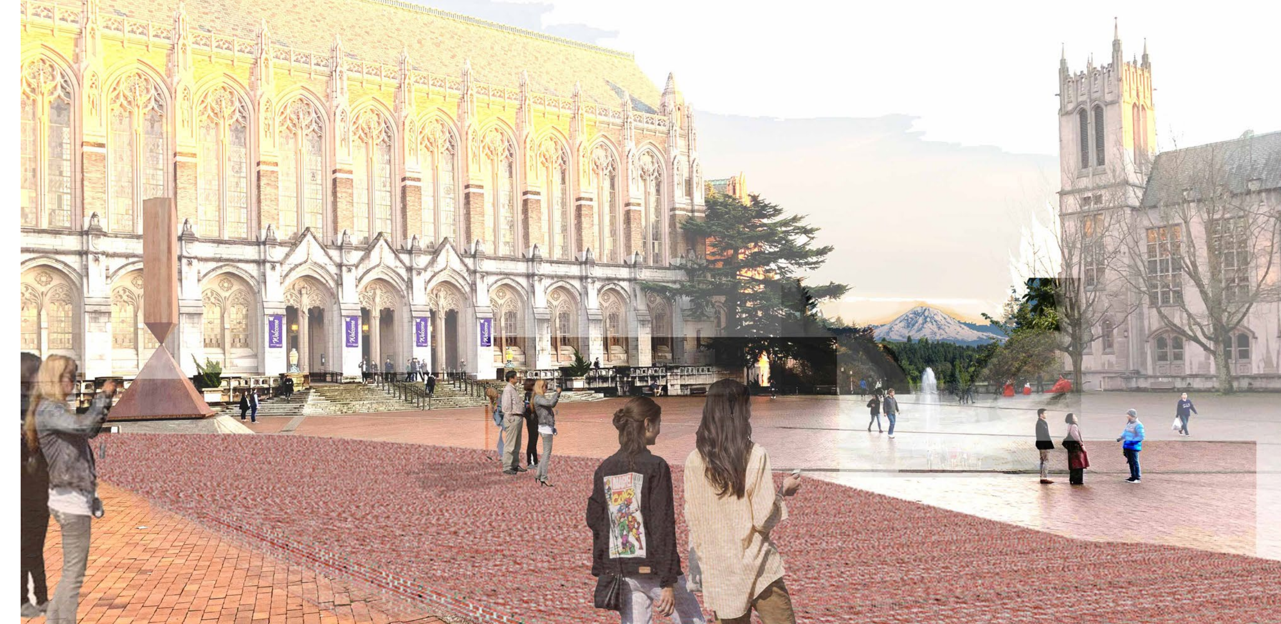
Views of Rainier Vista, Olympic range and Suzzallo library are enhanced and emphasized through an extended plaza from the existing steps.