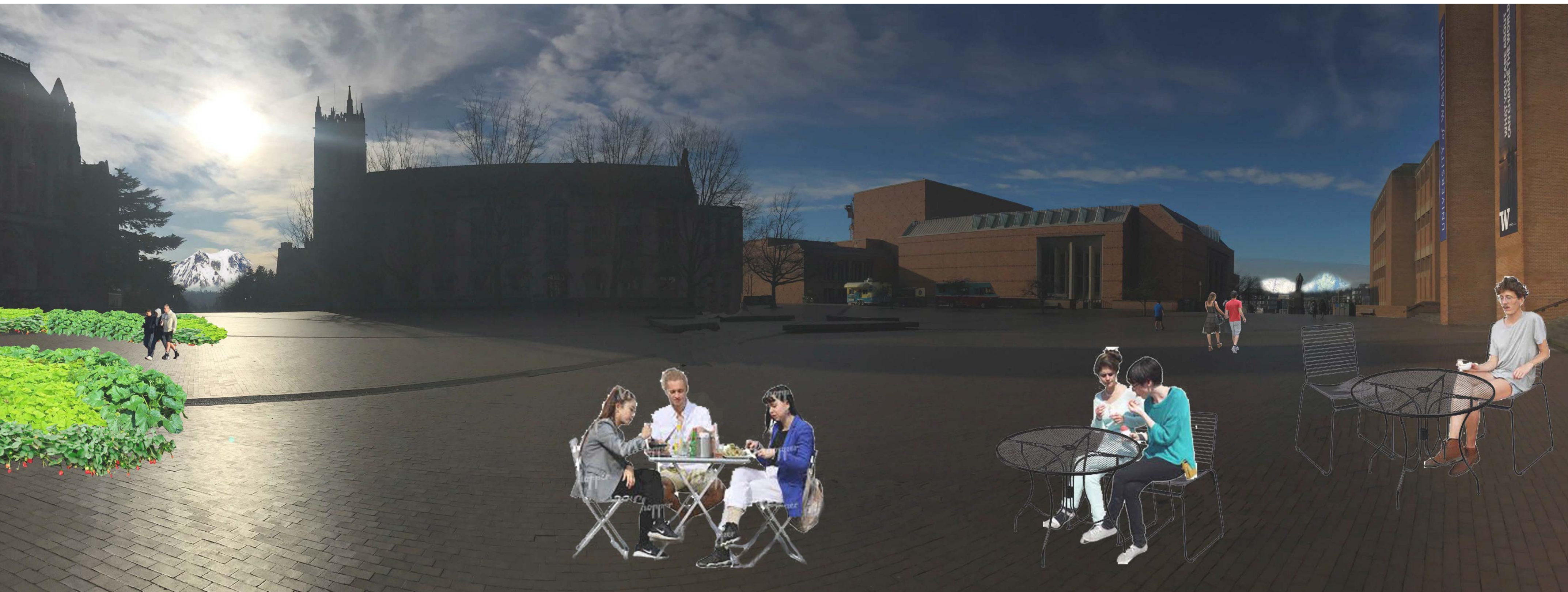
Red Square looking out at Olympics and Rainier